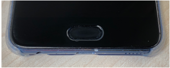
Figure 3: Home button covered with lip balm to prevent the fingerprint sensor from recognizing the users' fingerprint.